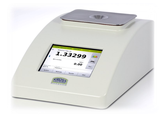
Model DR6000 Series Digital Refractometer